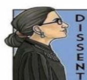
RUTH BADER GINSBURG